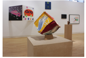
Project Ability Gallery